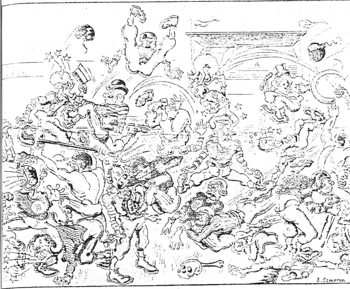
PAGING GRAHAM McNAMEE

The Woodman-Duggan battle waged to the right of the picture was censored by the Rugby Union.