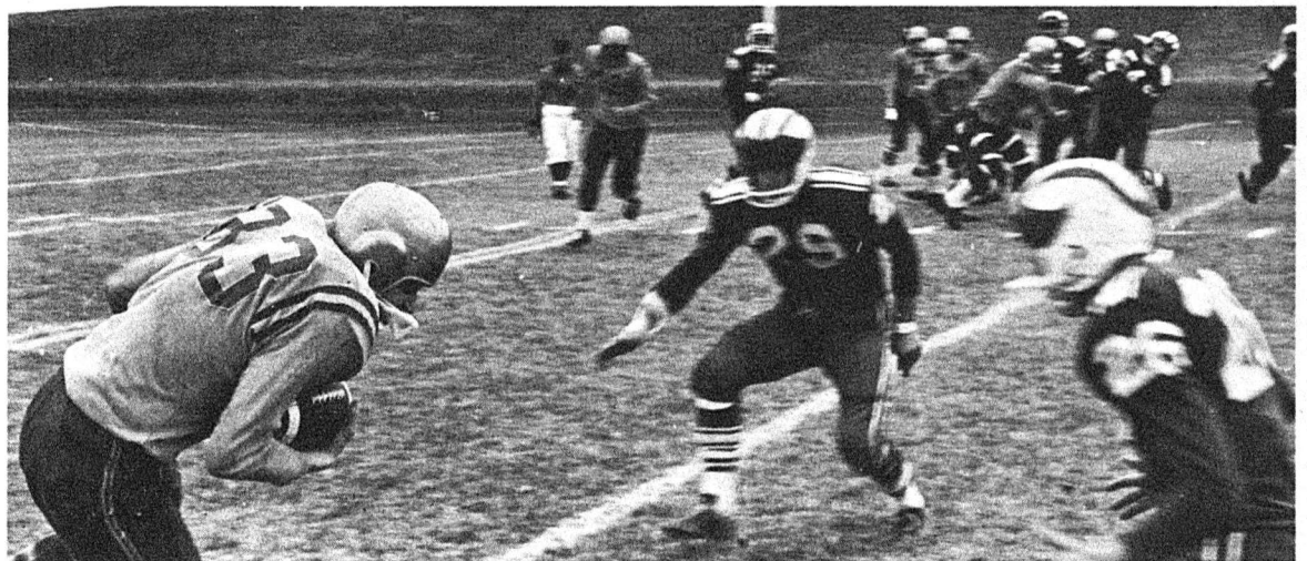
OUTA MY WAY —says an angry Bear as Husky tacklers close in for another kill in Saturday's 27-21 defeat.

The Bisons, reputedly a tough team, will host the Bears in Winnipeg on Saturday.