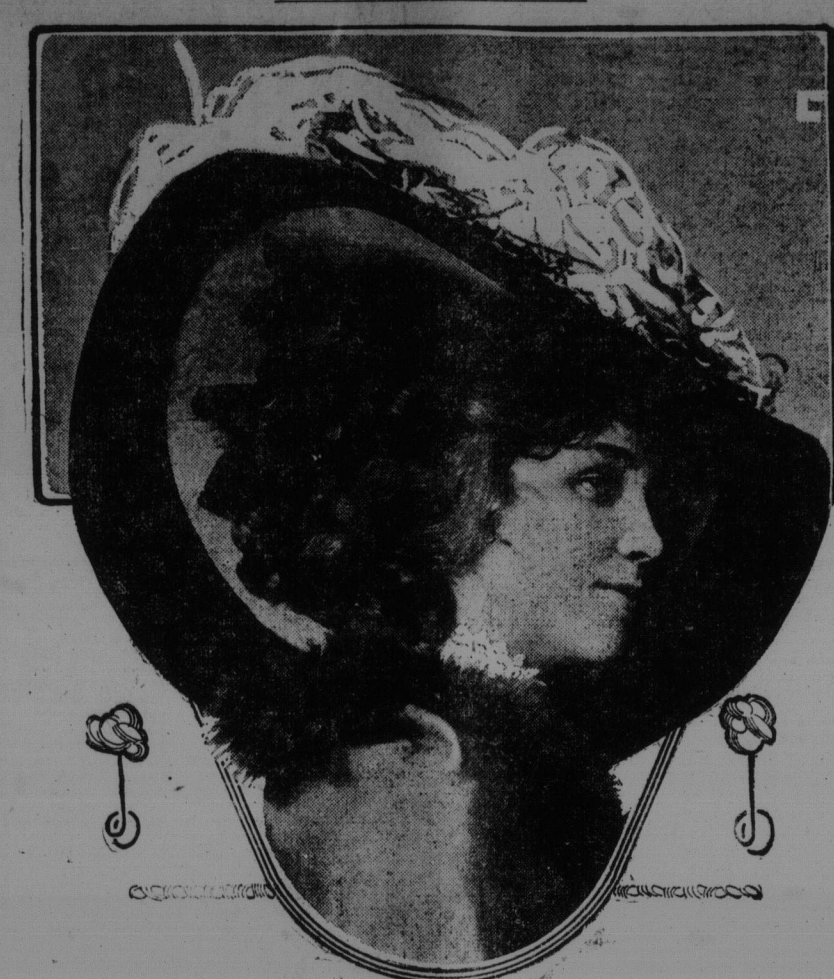
Who wouldn't be joyously happy to wear this hat down the street, sure of mingled admiration and envy all along the line? And how willing the mere male person would be to accompany the wearer of such a creation! It's made of gray velvet with black velvet border. Swirling all over the crown and brim are white plumes, flecked with black.