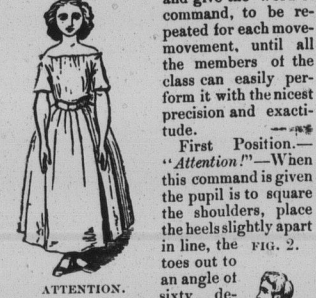
FIG. 2. The knees straight, the arms hanging easily by the side, and the hands open to the front. The chest must be slightly inclined forward, the abdomen moderately drawn in, the head erect, the eyes looking directly forward, and the weight of the body resting more on the heels (fig. 1).

The preceding is substantially the "military position," which brings the ear, shoulder, hip, knee, and ankle into a line, as seen in fig. 2.