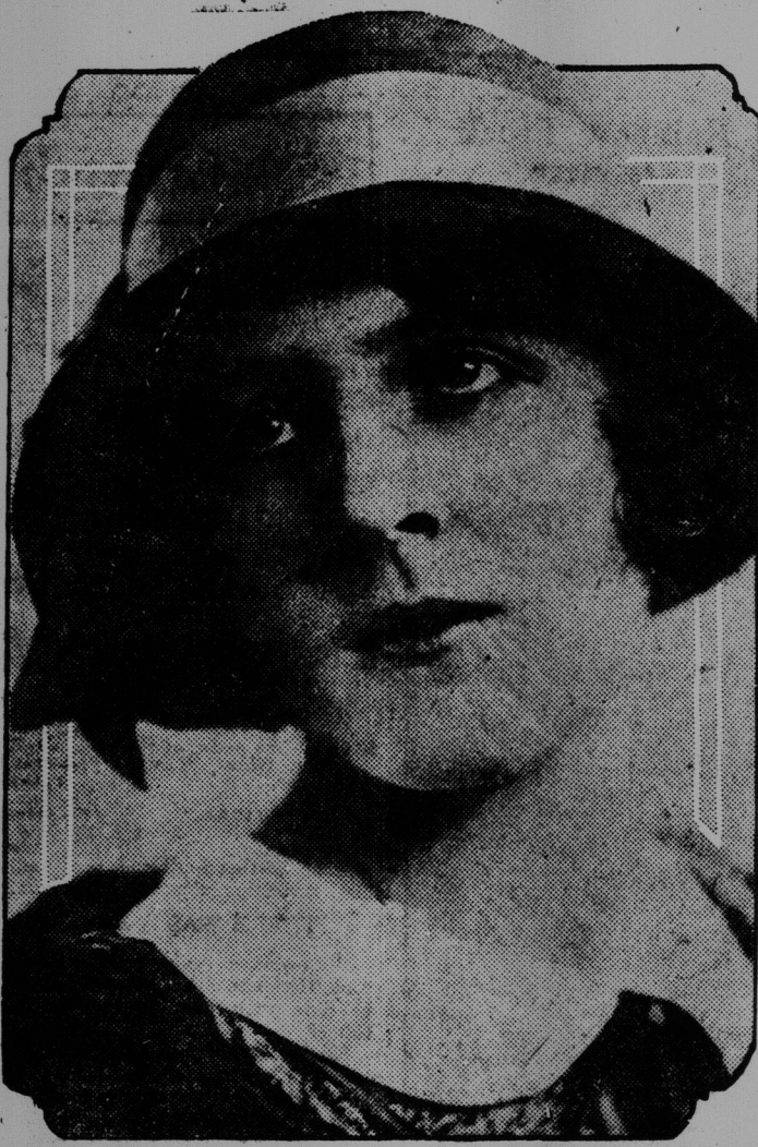
Mollie Panter-Downs, 17, is as beautiful as she is successful. Her first novel, "The Shoreless Sea," won instant recognition for her in England and she has just released another, "The Chase."