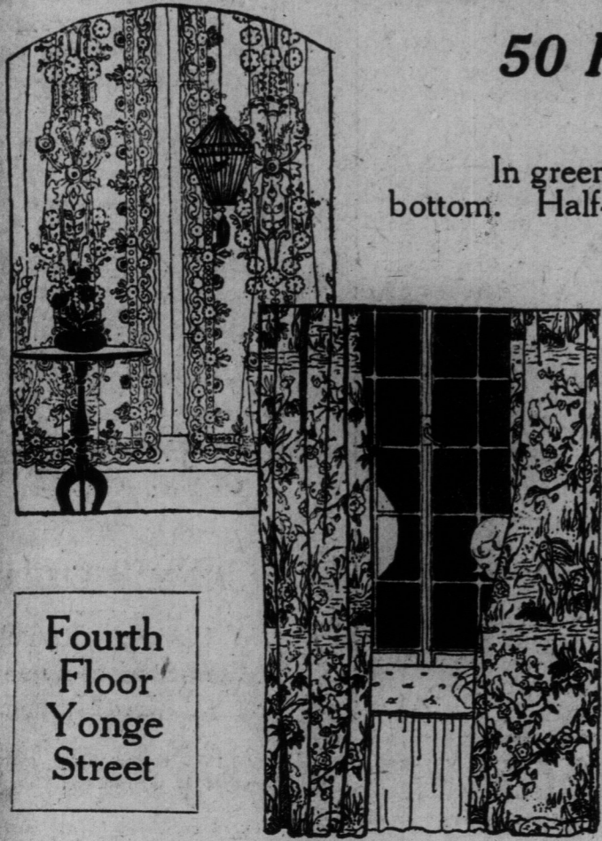
Fourth Floor Yonge Street

Of Special Interest on the Last Day Are These Seven Extra Specials in Nottingham Lace Curtains