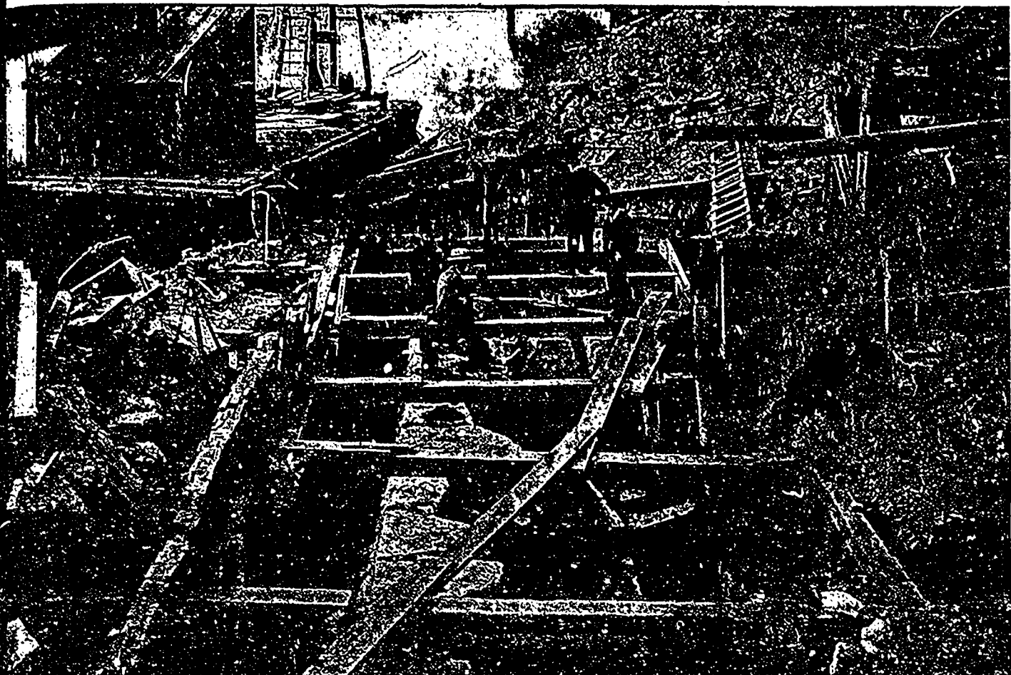
QUEEN STREET BRIDGE OVER DON RIVER, TORONTO—EAST ABUTMENT.