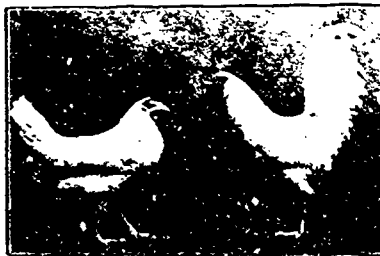
"Champion Strain" Single-comb

Starting in the business about eleven years ago, putting a good machine on the market, looking after their business closely, and treating their customers fairly, they have now erected at Homer City a plant that is fully equipped, and incubators and brooders are manufactured at the rate of 50 to 60 machines per day. This company enjoys a splendid reputation and any of our readers who contemplate purchasing machines for the coming season should not fail to address the Company for catalogue and supplement, giving a complete description of their style A and style B machine. Write them at once and catalogue will be sent you. Prairie State Incubator Company, Homer City, Pa.