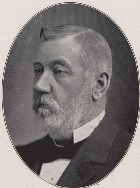
JOHN MEARNES, M.D.; MAYOR OF WOODSTOCK, WOODSTOCK.