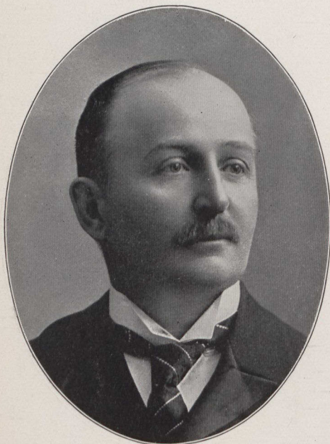
HON. SIMON NAPOLEON PARENT, K.C.; PRIME MINISTER PROV. OF QUEBEC; MINISTER OF LANDS, MINES AND FISHERIES; MAYOR OF CITY OF QUEBEC; PRESIDENT QUEBEC BRIDGE CO., ETC., QUEBEC.