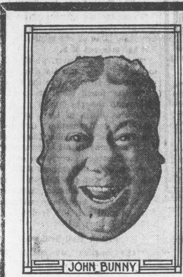
JOHN BUNNY AT THE NICKEL TO-DAY

"The bait was too tempting not to be swallowed, and several German cruisers with a flotilla of destroyers dashed out to seize so easy a prey. The British, spooling for a fight, did not hesitate to give battle against superior numbers, and for twenty-five minutes the two cruisers and the destroyers fought, under odds as great as those against which a few days before, the British held the Germans at bay for four days and remained unbroken in the north of France. Following their plan of operations, the British drew away to the open and