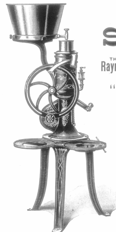
"NATIONAL" NO. 1 HAND POWER. Capacity, 330 to 350 lbs. per hour.

Tavistock, March 20, 1901. CHAS. I. ZEHR.