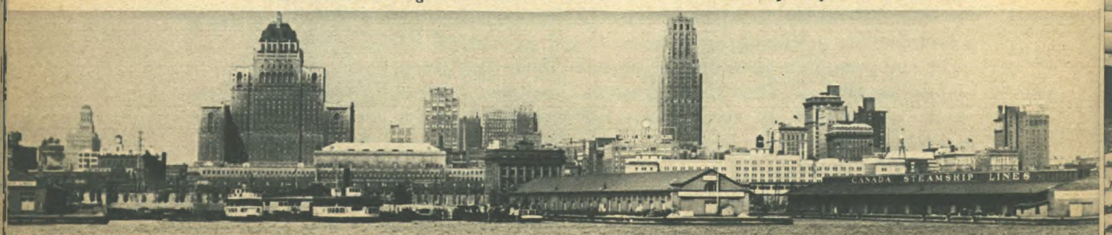
Toronto's skyline from Lake Ontario.