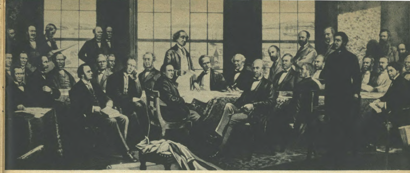
They founded a nation (Confederation, 1867).

The traditional Canadian lumberjacks, shipwrights and fishermen were being rapidly outnumbered by farmers tilling the broad "sections" of the prairies, producing a new Canadian staple—wheat. High tariff policies were adopted to foster the growing industrial economy.