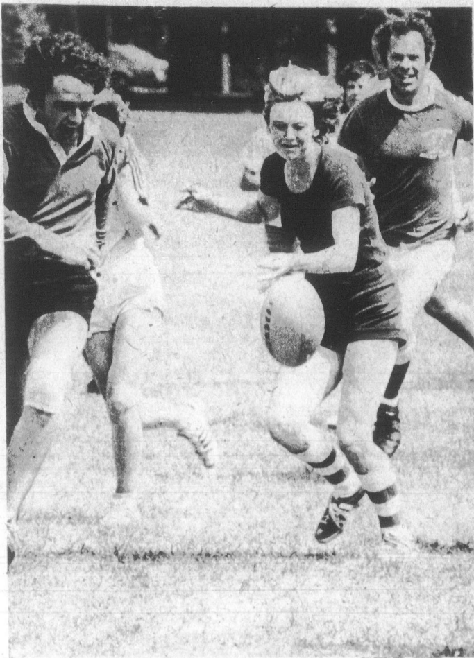
Fairer sex, indeed