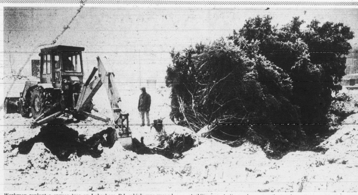
Workmen replant a spruce tree on Lakeshore Rd. which was moved improperly by a developer, according to a member of Save Our Trees

A salesman in the Southdown Park mobile office said he knew nothing of the transplanting, and other representatives of the developer could not be reached. .