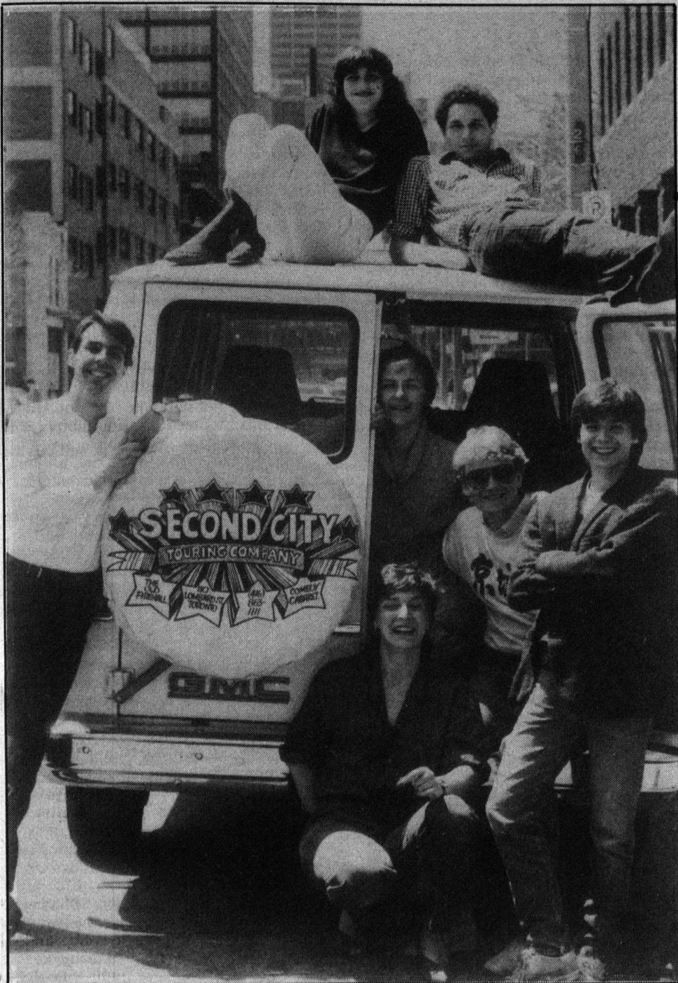
Toronto based company cruises into SUB Thursday.