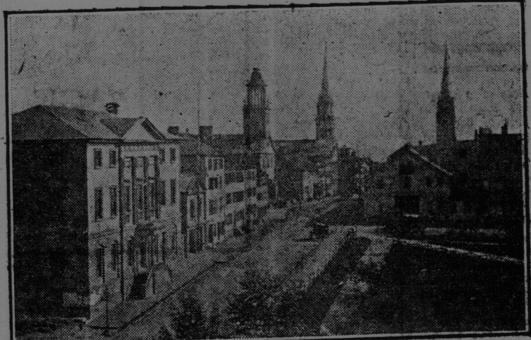
East Side of King Square as it Looked Fifty-five Years Ago Today.