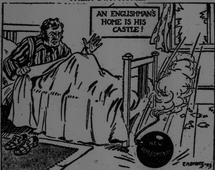
There is indignation in certain quarters in Britain over the

OFFICIAL ENCOURAGEMENT FOR THOSE WHO OWN THEIR OWN HOMES