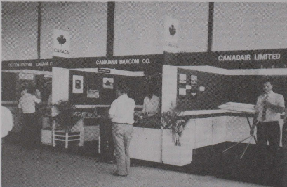
Finishing touches are made to the Canadian booths just prior to the opening of the Jakarta Air show.

The Government of Indonesia remains dedicated to the growth of its aerospace industry as evidenced by the US$17 million commitment to stage this event. The Air Show served to celebrate the 10 year anniversary of Indonesia's aircraft manufacturing industry, showcased the country's industrial achievements and marked Indonesia's place on the stage of the world's aircraft industries.