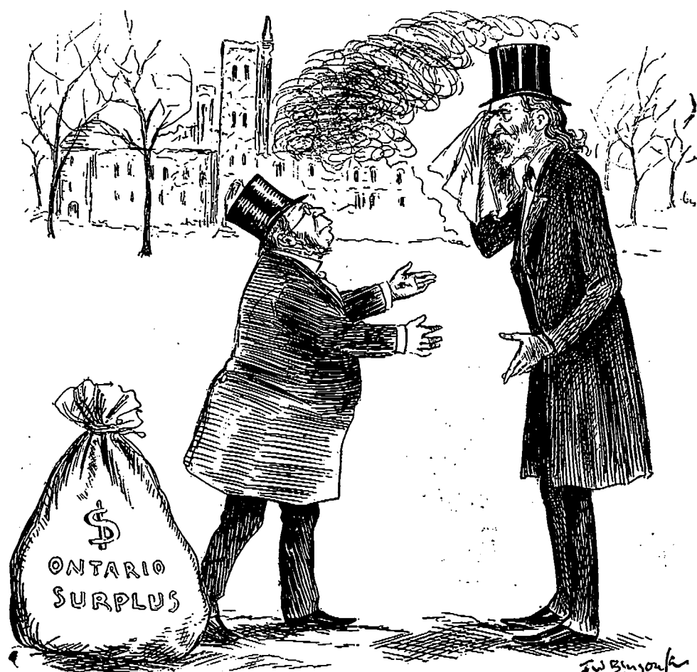
THE PEOPLE WOULD APPROVE IT, TOO!