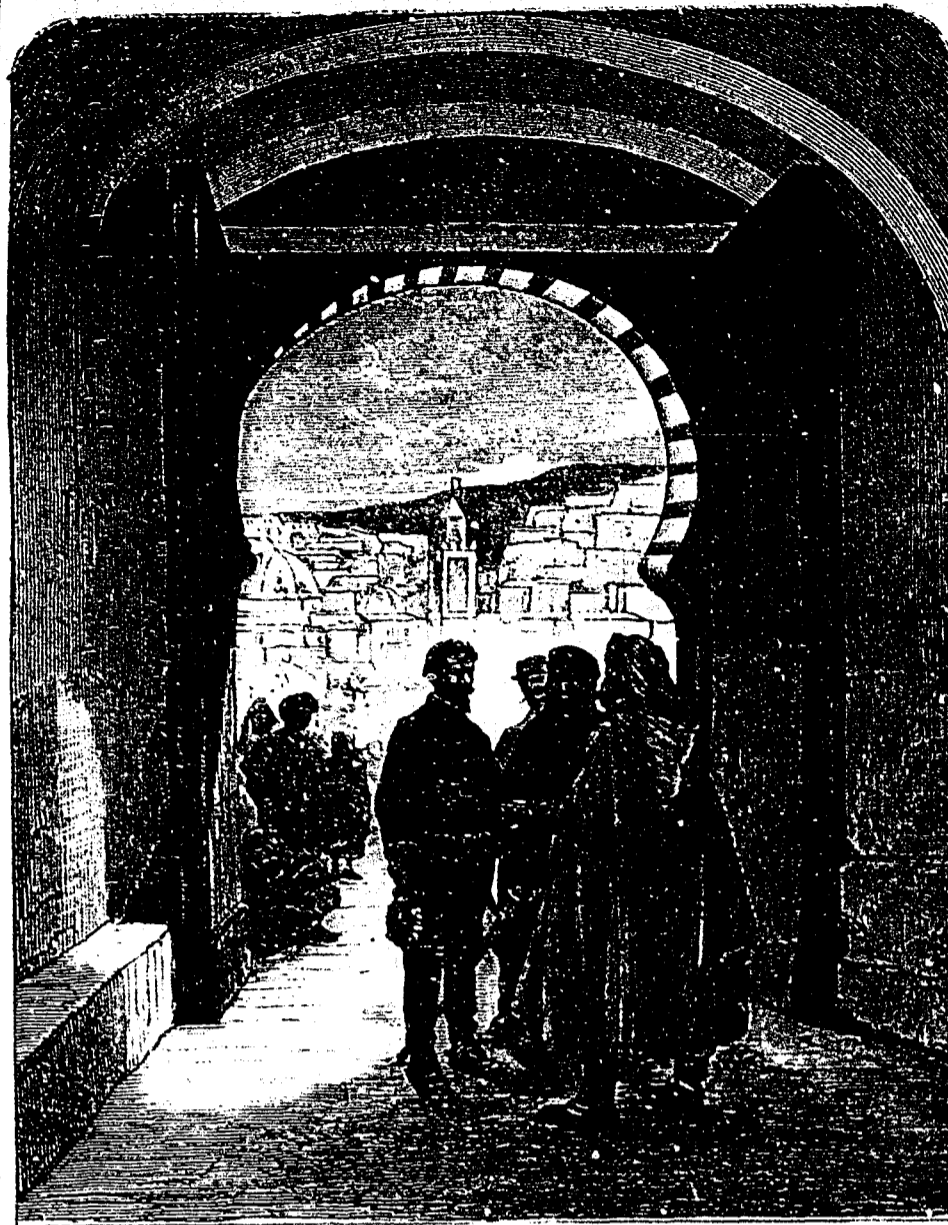
TUNIS.—THE BEY SURRENDERING THE KEYS TO THE FRENCH.