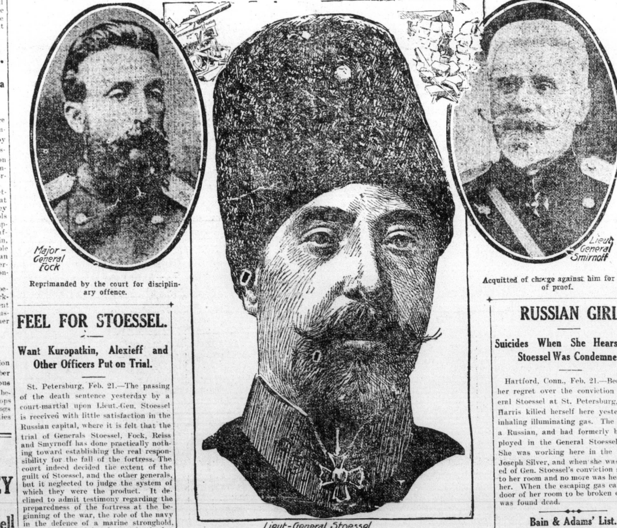
Lieut.-General Stoessel Sentenced to death for loss of Port Arthur.

Bonquet and Hilda cigars, union made, 8 for 25c. Stowell Jackson cigars, 6 for 25c. Japs, Barristers, J. C. F.'s, Marguerites, 4 for 25c. Julia Arthur cigars, 6 for 25c. at peace's cigar store, 107 King street east.