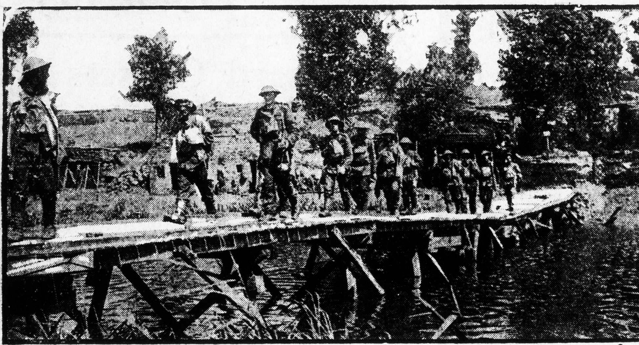
Battle of Menin Road.—Infantry crossing the stream after having driven the Hun back.