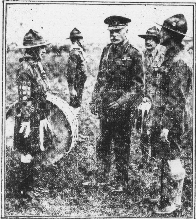
Photo shows Earl Haig and the drummer of the 5th Greenocks Band, the world's champion Scouts' band.