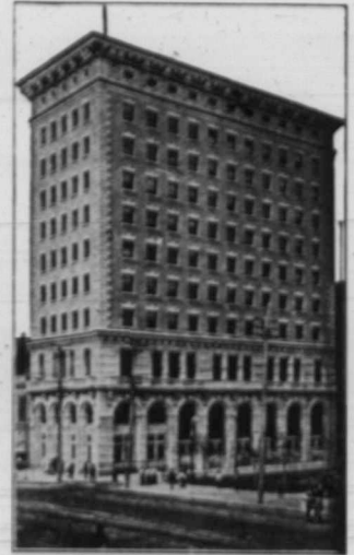
Union Bank Building, Winnipeg

BRITISH COLUMBIA—Prince Rupert, Vancouver, Vancouver (Mt. Pleasant), Victoria.