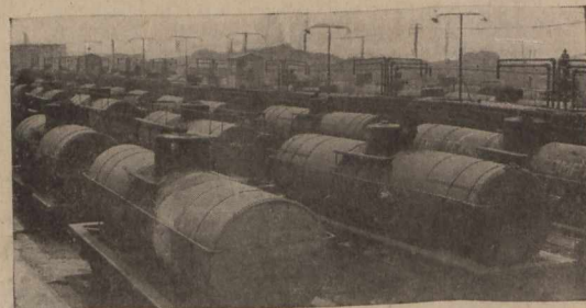
“Imperial Asphalts can be quickly delivered to any part of the Dominion. They come in tank cars or packages, whichever is best suited to your requirements.”

“There are three Imperial Asphalts for road purposes, Imperial Paving Asphalt for preparing Hot-Mix Asphalt (Sheet Asphalt, Bitulithic, Warrenite, or Asphaltic Concrete), Imperial Asphalt Binders for Penetration Asphalt Macadam and Imperial Liquid Asphalts for dust prevention and for increasing the traffic-carrying capacity of earth, gravel and macadam roads.”