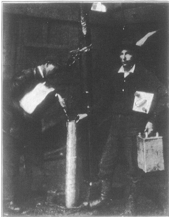
Pouring Nitro-glycerine into the cylinders to lower into Well for "Shooting" the Oil Sands.