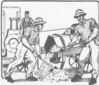
The Old Way of Handling Concrete.