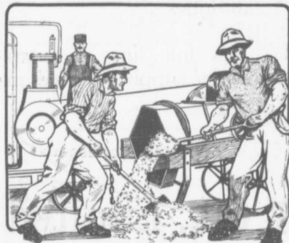
The Old Way of Handling Concrete