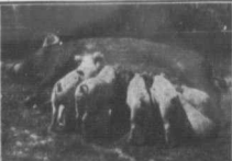
A family like this, may be yours next spring