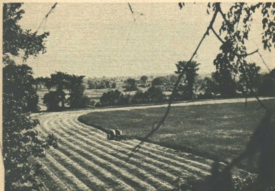
5) Haying on an Ontario farm