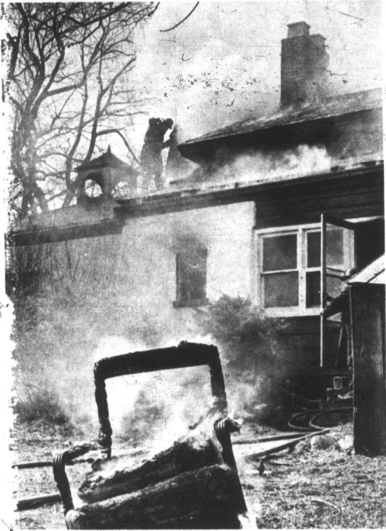
Mississauga firemen battle house blaze on roof while furniture burns in the front yard. Two small children escaped injury in the incident.