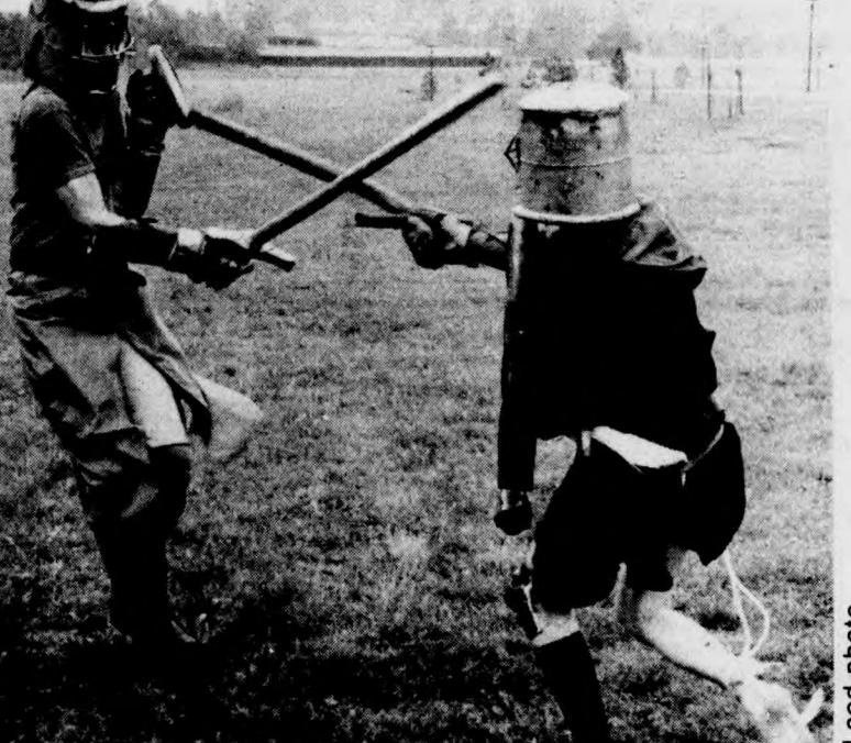
Society for Creative Anacrhronism members battle on the Stong plains for some lofty ideal and the use of a can opener.