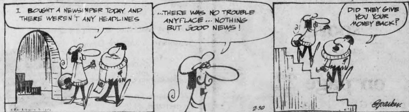
by Brant Parker and Johnny Hart

Once Again HOCKEY FANS UNB Red Devils battle Mt. A. tomorrow night 7 p.m. Lady. Beaverbrook Rink Y'all come!!