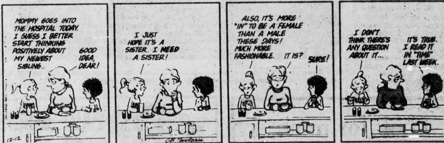
by Garry Trudeau