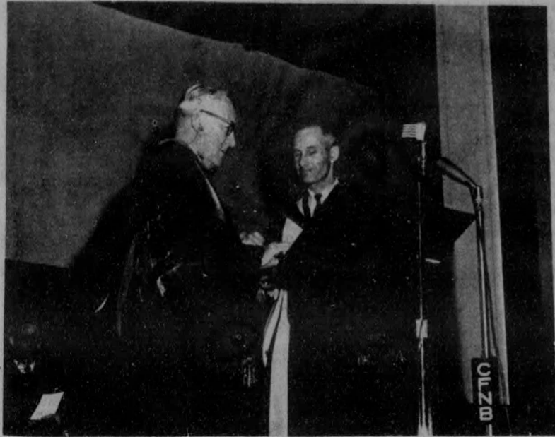
Payment of Quick Rent