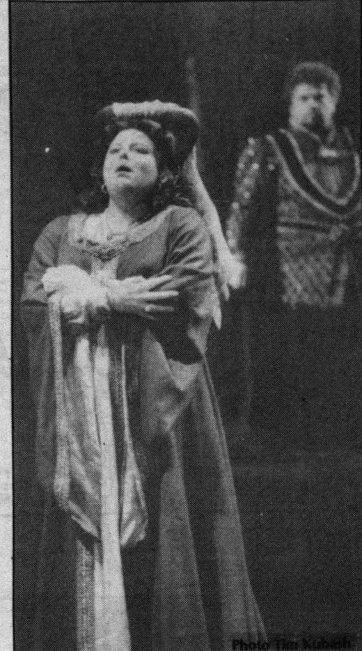
Il Trovatore: a notoriously convoluted drama