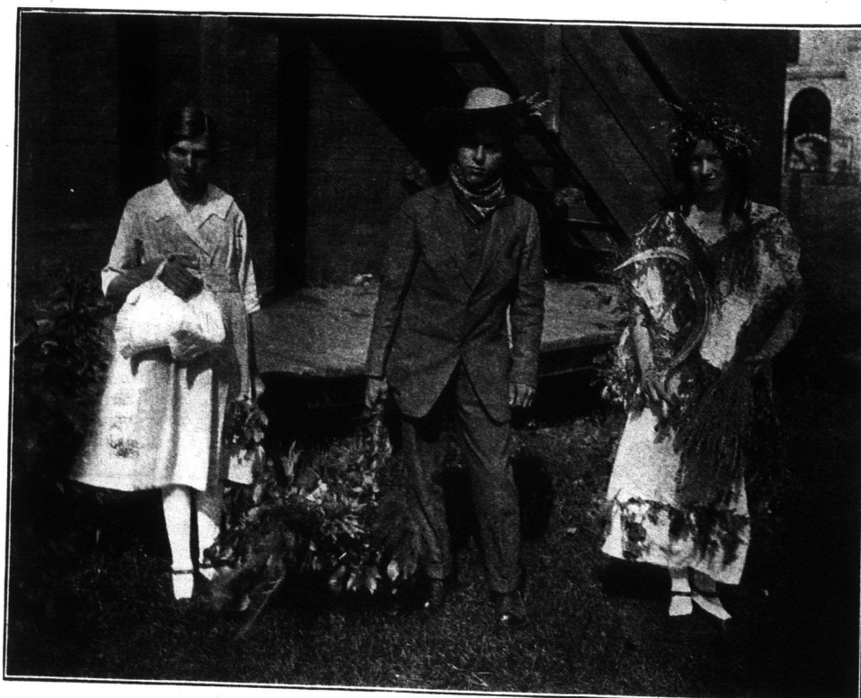
Officers of Boys' and Girls' Club, Gladstone, Manitoba, who presented the Duke of Devonshire, when on his trip throughout the West, with a basket of Manitoba grains and grasses.

The first prize in the choral contest for juvenile choirs, together with the Frederic Smith Challenge Shield, was won by Lake Road (Portsmouth) Band of Hope; the first prize for mixed-voice choirs from thirty to fifty singers, together with the Curwen Challenge Shield, was won by the Stamford (Portsmouth) Temperance Choral Society; and in the mixed-voice contest for choirs from 60 to 100 singers, the first prize and the Cory Challenge Shield was won by Portsmouth Excelsior Temperance Choral Society.