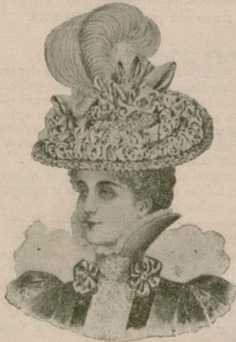
Fancy Straw Hat, Ribbon gathered round brim, Bows at back, Ostrich Tip and Paradise Osprey, with Bow and Flowers under brim.