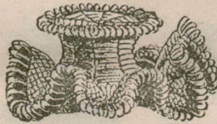
Ladies' Turban, Hair Crown, Fancy Straw Brim, Black only. 60c.