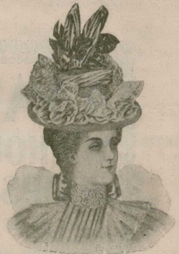
Ladies' Fancy Straw Hat, Ruching of Pleated Chiffon round crown, Quills and Bird at side.