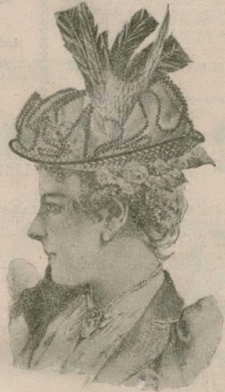
Ladies' Straw Hat, Flowers and Lace round brim, Ribbon Bows and Foliage at back.