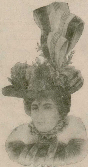
Ladies' Straw Hat, Flowers round crown, high Ribbon Bows at side.