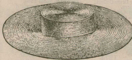
Ladies' Leghorn Flop, Natural Bleach, Fine Quality. 79c.