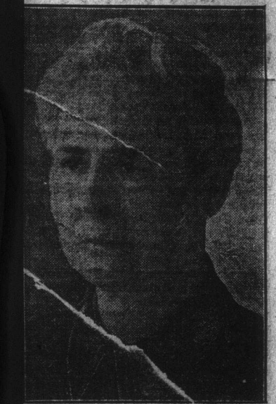
ENERAL BRAMWELL BOOTH. Nov. 1, and in Toronto a few days er. The occasion will be made memor-e by a great army demonstration in