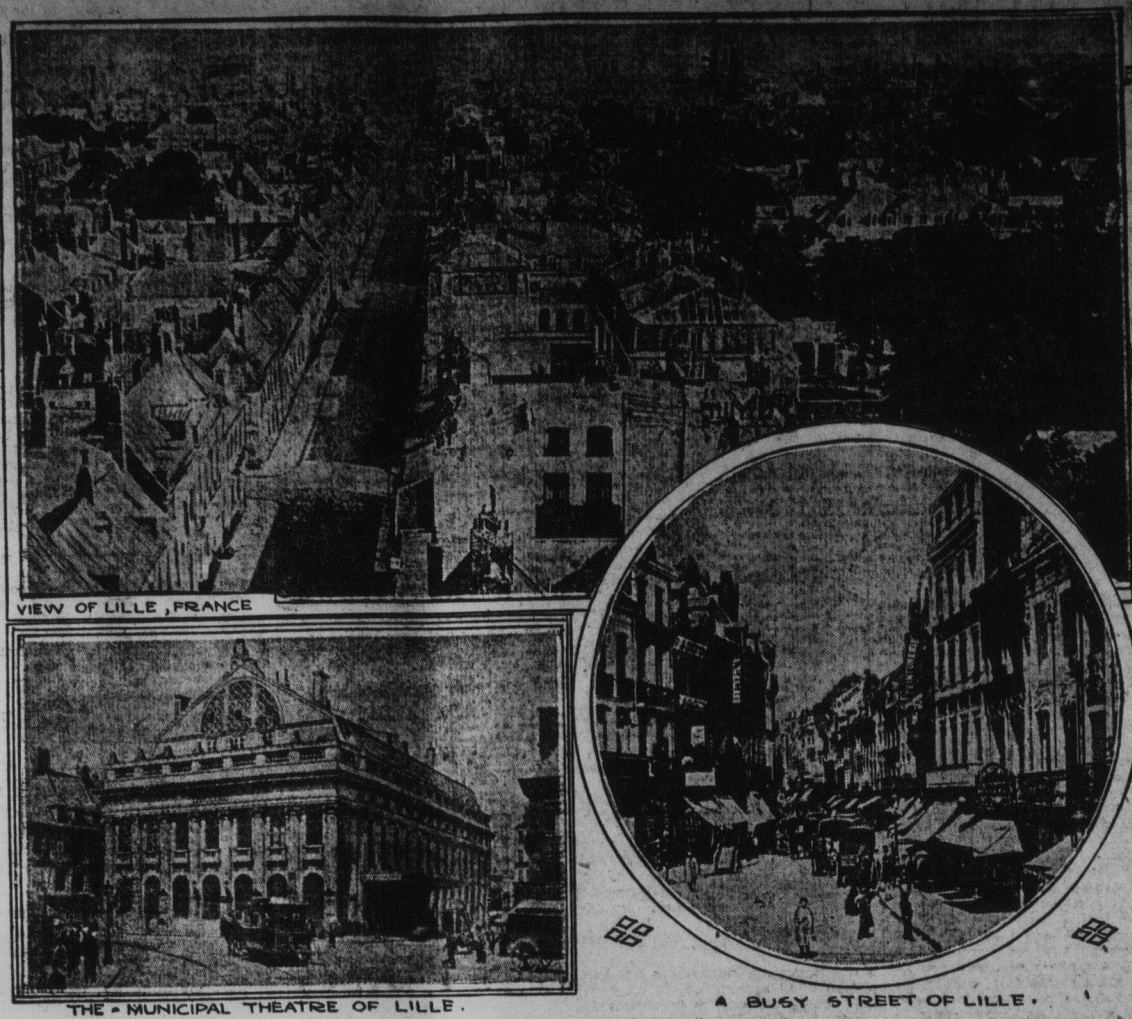
VIEW OF LILLE, FRANCE

Moncton, June 27.—The old wooden bridge spanning the Petitcodiac at Moncton and which has recently been replaced by a steel structure, started by the Murray government, is being dismantled out today. One large span was successfully blown out and safely landed to the shore. The work of tearing out the huge wooden structure will occupy some time.