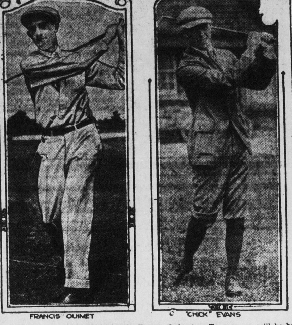
FRANCIS OUMIET and CHICK EVANS

"Will the new golf champion be Evans, Ouimet or Travers—or will be some one else?"