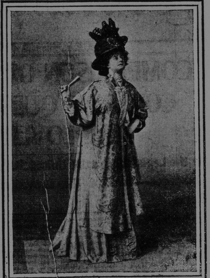
SMART AND PRACTICAL COSTUMES FOR THE RACES.

(New York Journal of Commerce.) In the demand which Samuel Gompers is making upon the political parties of this country for legislation claimed to be "in the interest of labor," such as restriction upon the judicial power of injunction in behalf of unions and exemption of labor combinations from laws prohibiting restraint of commerce, it is assumed that