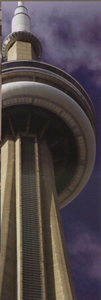
CN Tower, Toronto

Canada is one of the most competitive, dynamic, and innovative locations to do business in the world. Many of the world's top companies have invested in Canada and more are considering Canada as their next investment destination.