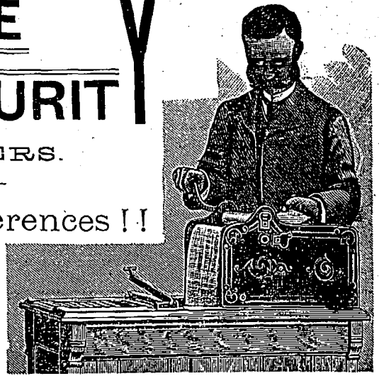
RAPID ROLLER DAMP-LEAF COPIER.

The SHANNON CABINET and RAPID ROLLER COPIER in use, afford the most perfect system for filing together Letters and Copies of answers to same.