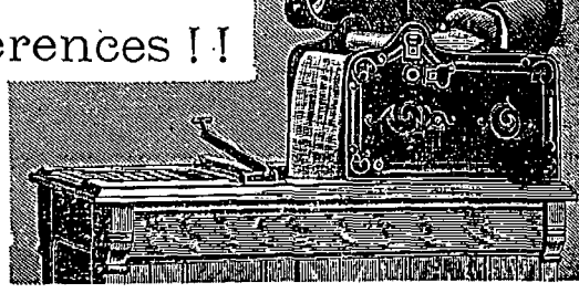
RAPIDEROLLER DAMP-LEAF COPIER.

The SHANNON CABINET and RAPID ROLLER COPIER in use, afford the most perfect system for filing together Letters and Copies of answers to same. Send for Circulars.