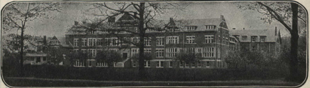
COLLEGE BUILDINGS FROM THE SOUTH