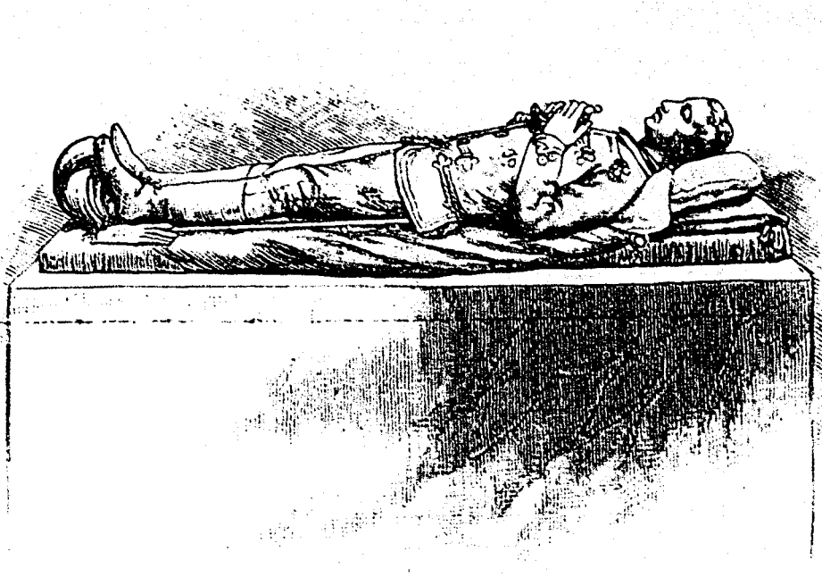
PROPOSED MONUMENT TO THE PRINCE IMPERIAL IN WESTMINSTER ABBEY.

WHISKERS or a luxuriant Moustache can be grown in a few days. Safe and reliable. Send address and 50c. to J. SEARS & CO., 100 King, Ohio, U.S. Stamps taken.