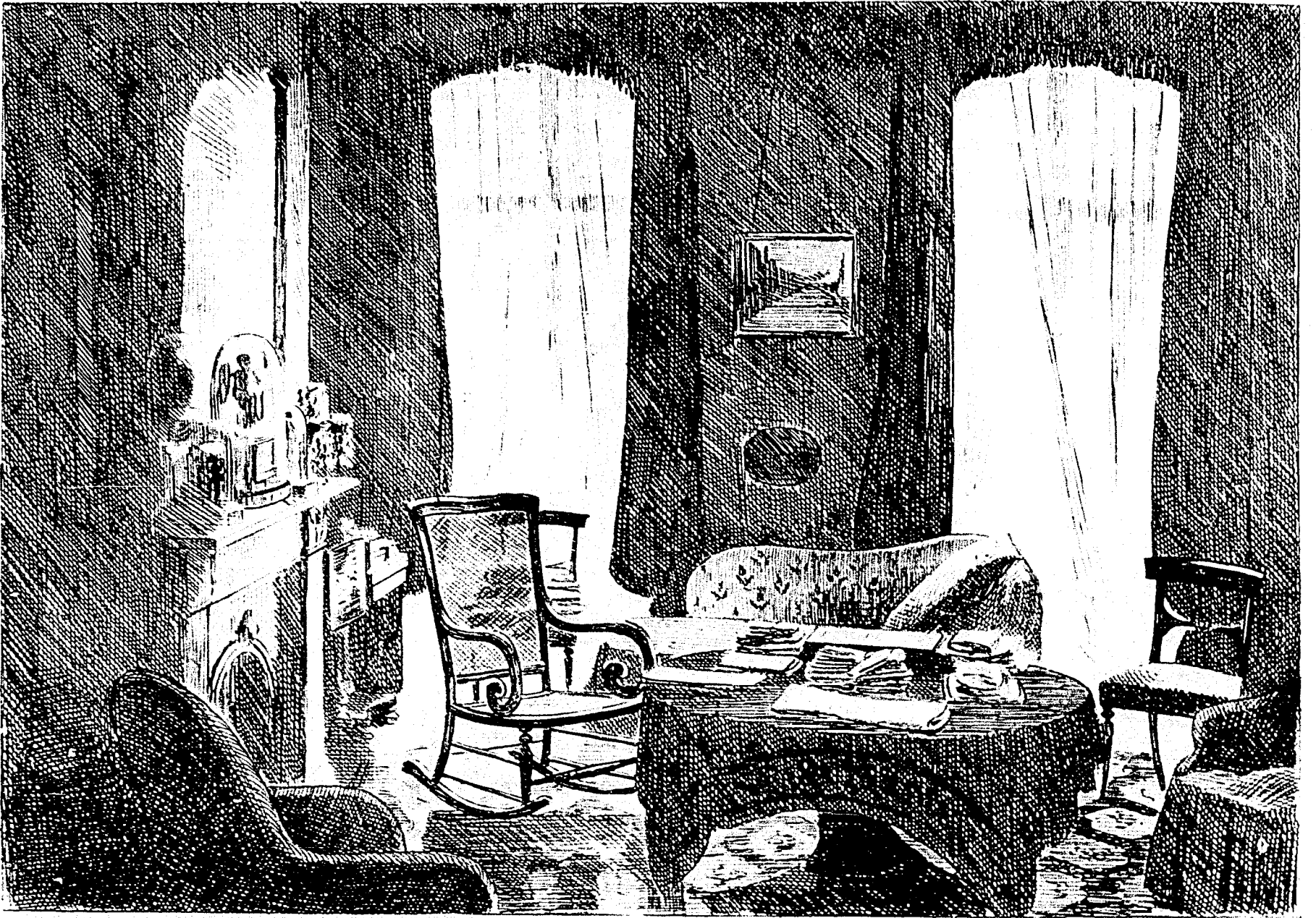
THE SITTING ROOM.