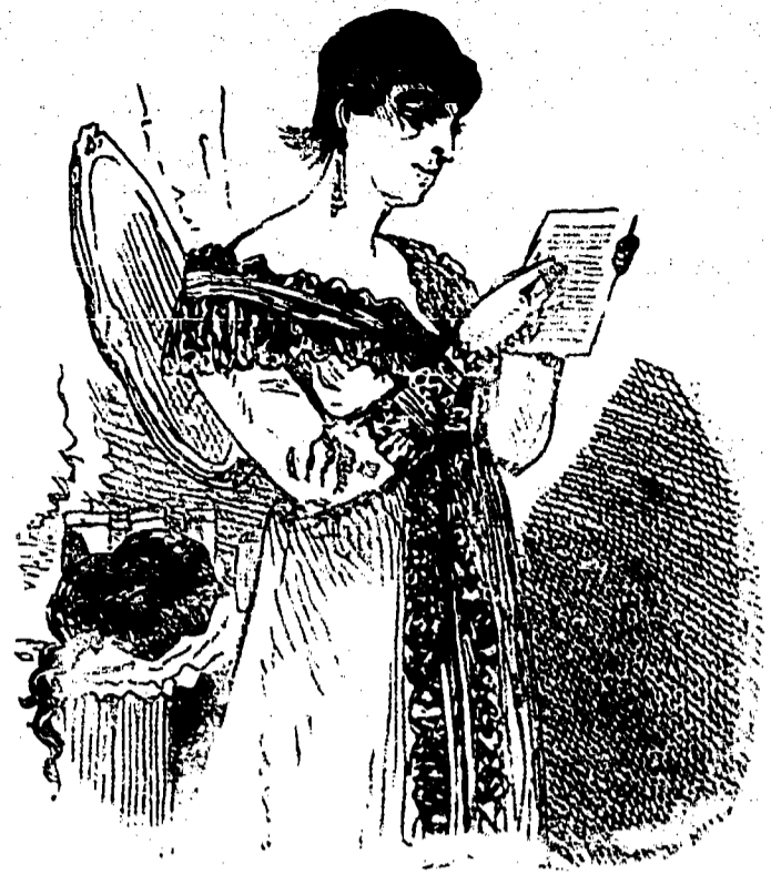
UNREASONABLE. "The Adored One" Give him one of my silk dresses, indeed! I fancy I see myself doing it. They're rather too expensive."