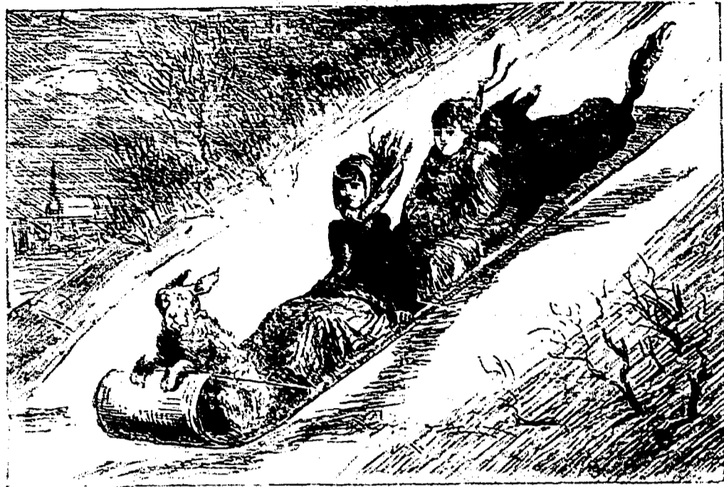
FOUR LEGGED SUBSTITUTES.