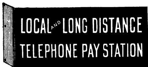
No. 7. Double, 19 1/2 x 8 inches, including flange. If made single, without flange, 18 x 8 inches.