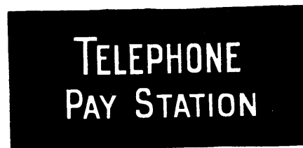
No. 8. Single, 18 x 8 inches.

These signs can be made in any colors. Blue and white are the most effective and are generally preferred.