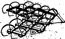
PATTERSON SPRING TOOTH HARROW. Wood frame - steel plated.

MASSEY-HARRIS SPRING TOOTH HARROWS are of two sorts:— (1) Patterson Harrow, wood frame pattern (steel plated), which is particularly adapted to rough lands; and (2) Solid Steel Spring Tooth Harrows which have adjustable teeth—are made of \pi shaped steel bars—are not damaged by exposure to weather—have teeth so fastened as not to work loose—are largely used in Quebec and Eastern Provinces.